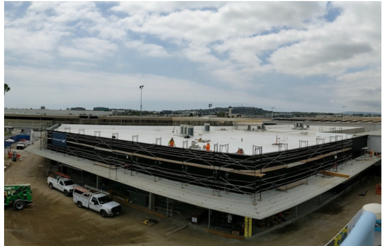
Roof work for the new Ticketing Building is complete and it looks fantastic!