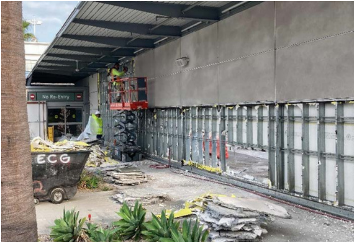
Demolition work is underway in preparation for the new Baggage Claim Area improvements.