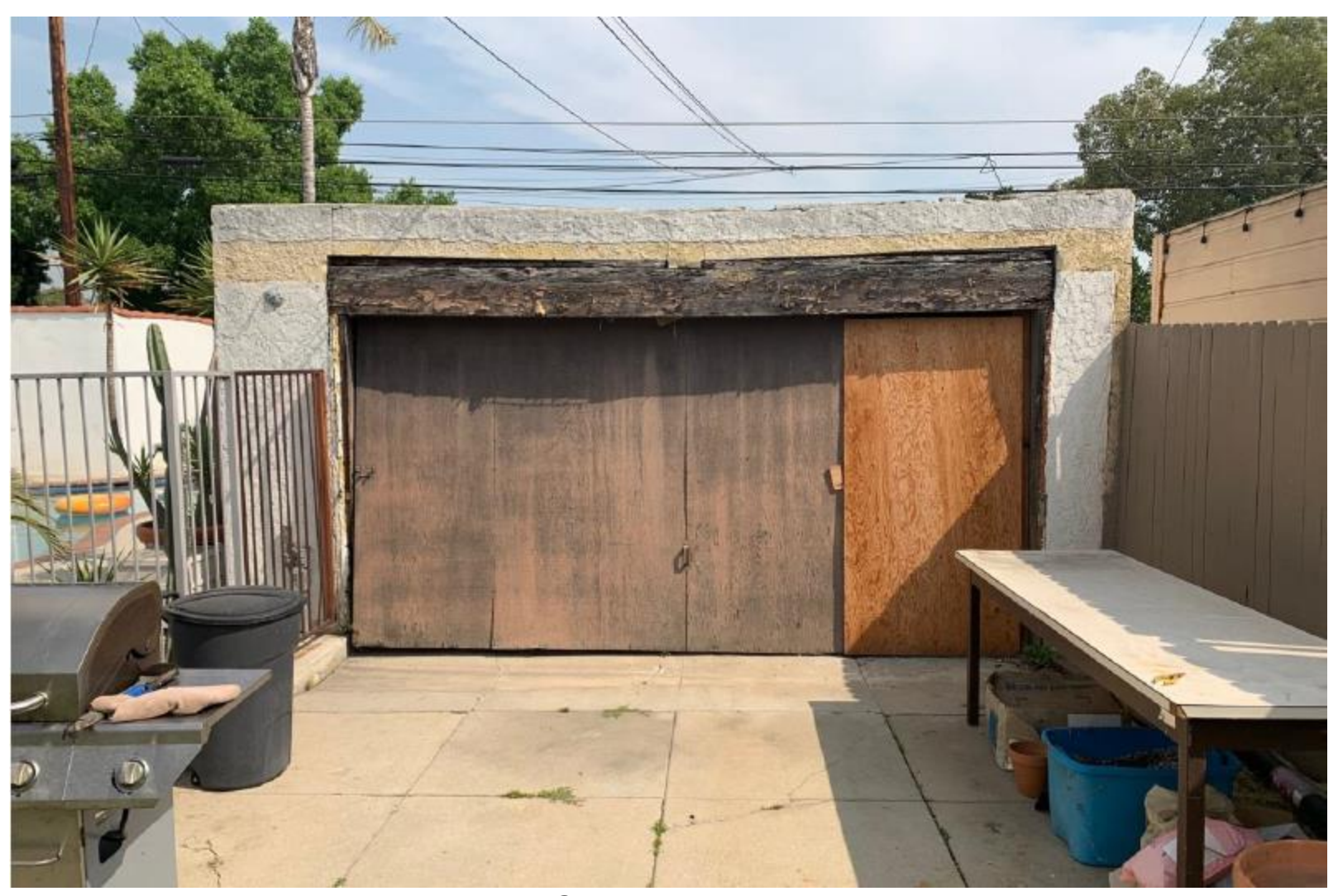
Existing Garage to be Demolished