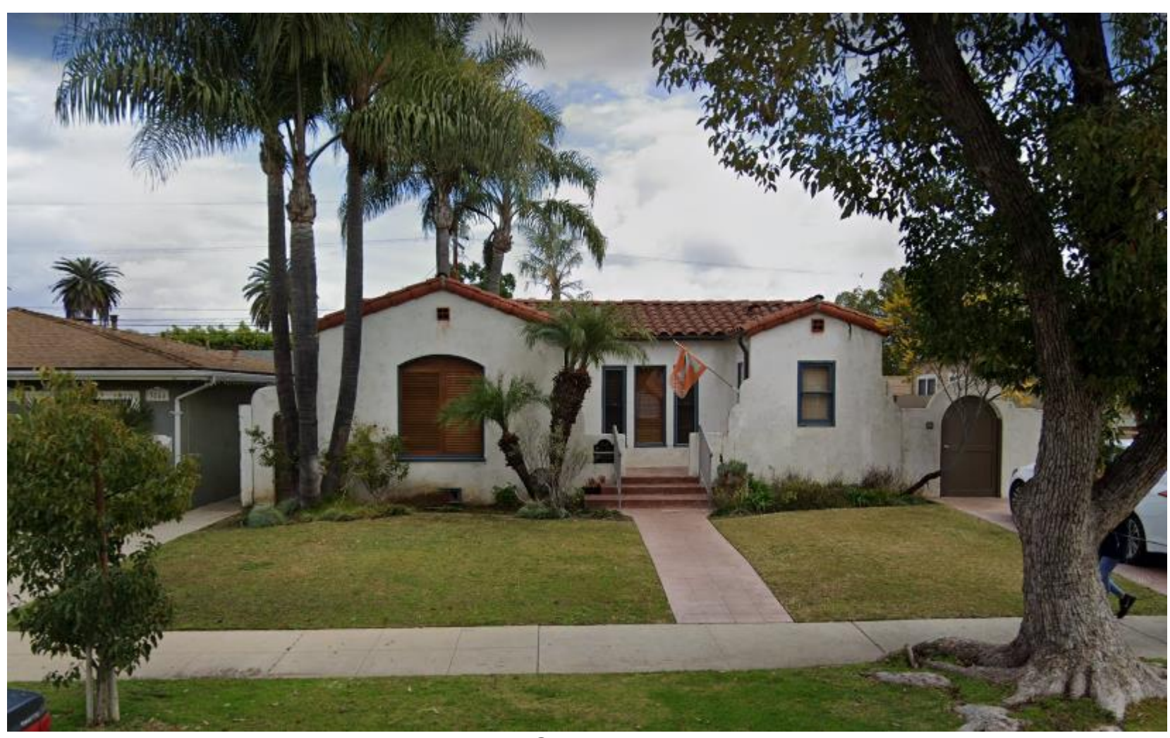
Front Facing Gundry Avenue