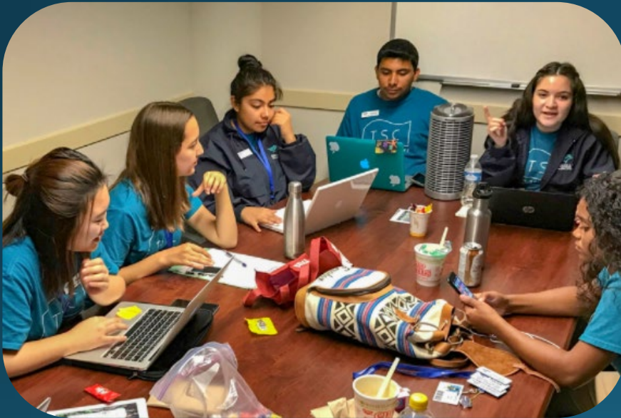
Aquarium Teen Climate Council