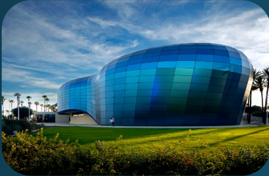
Pacific Visions Expansion (2019)