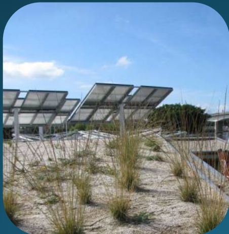
Watershed Classroom (2008)