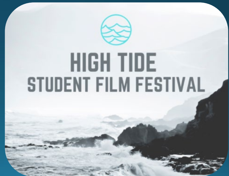
High School Film Festival