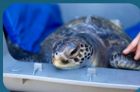
Sea Turtle Rescue