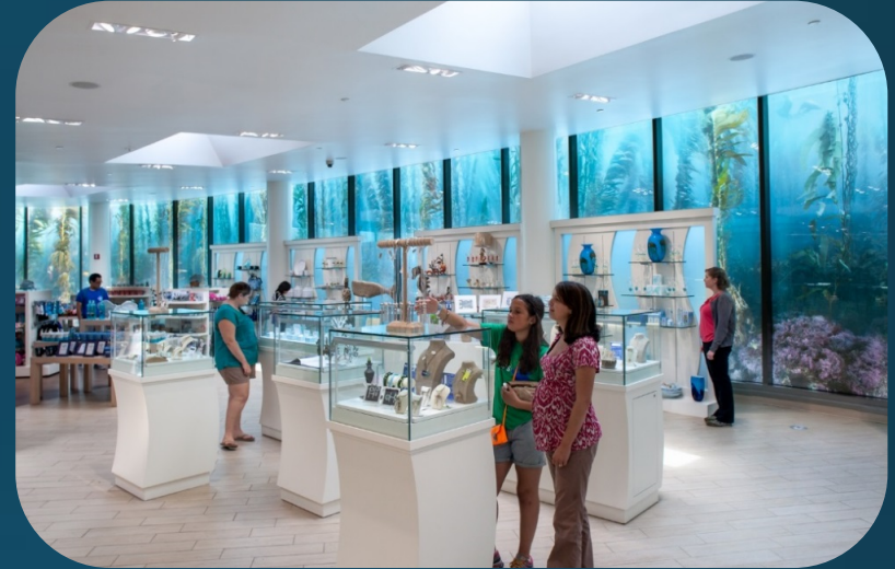
Pacific Collections (2013)