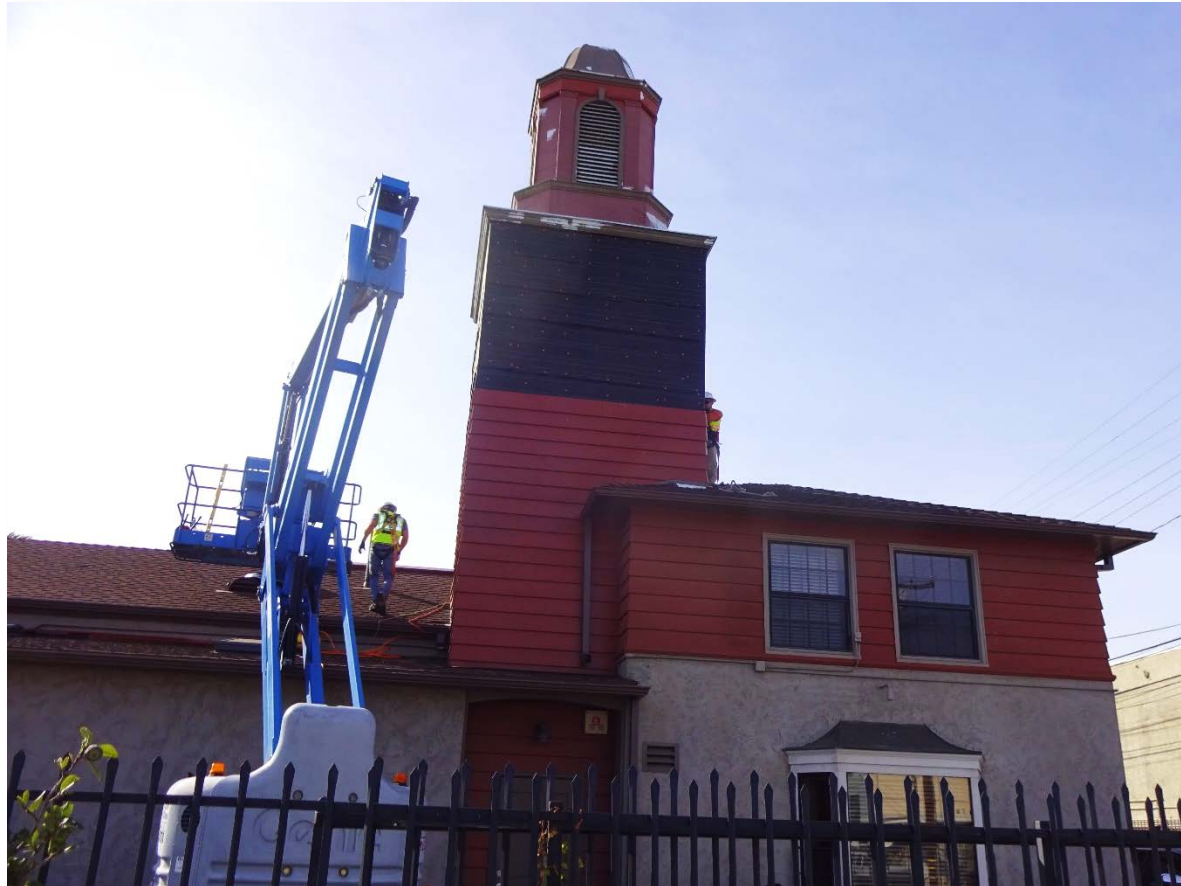
Fire Station 7