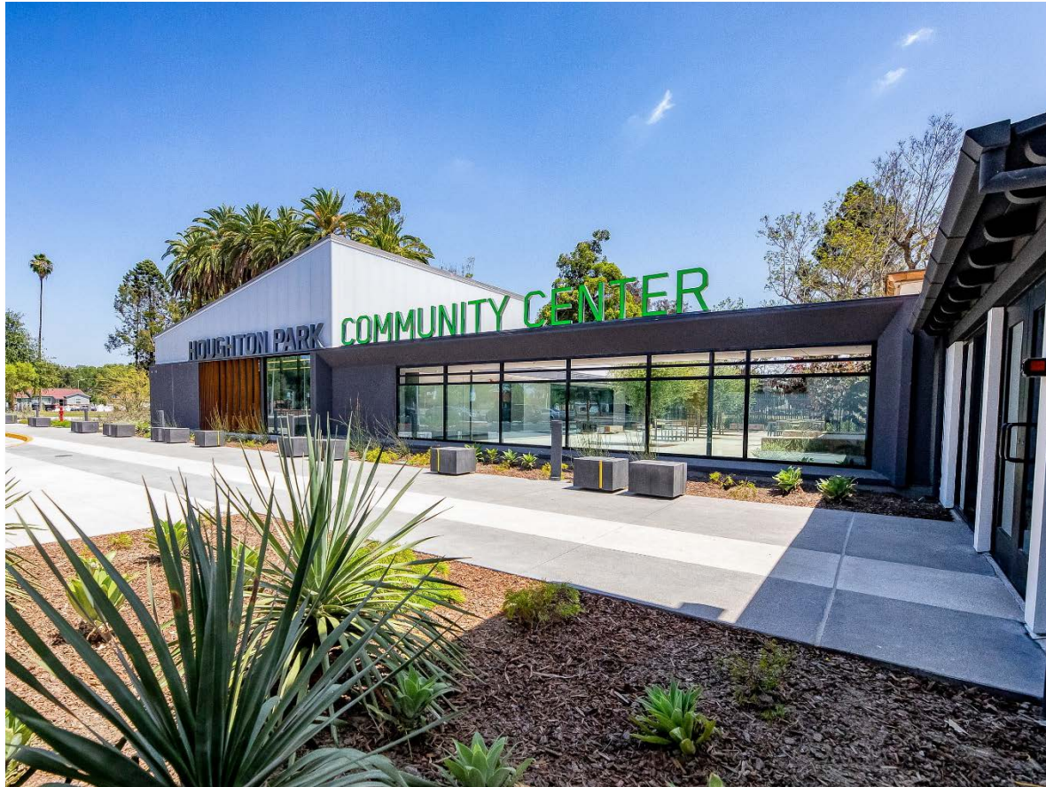
Houghton Park Community Center