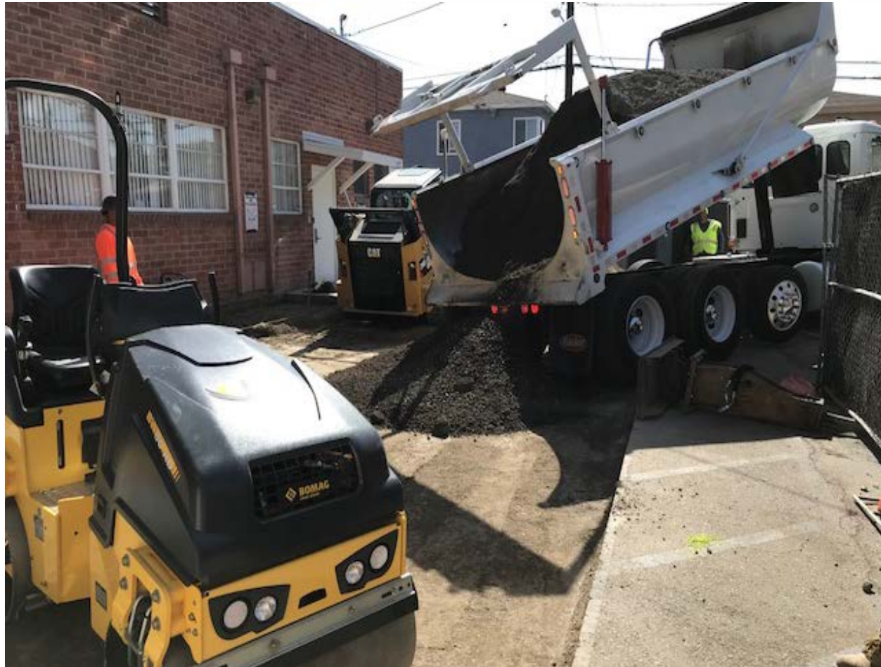
Los Altos Library