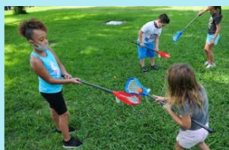
Wardlow Park Activities Reimagined on Colorful Patio, and With Distanced Craft Activities and Contactless Games

Long Beach Parks, Recreation and Marine (PRM) staff have worked hard to design opportunities for families and kids to have a healthy, active lifestyle this summer.