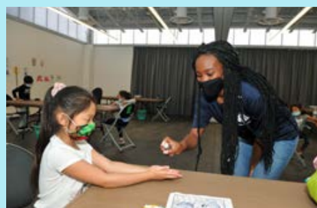
Getting Creative and Staying Safe at Houghton Park