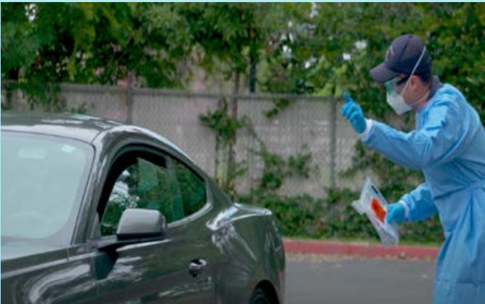
COVID-19 Testing Site Operations

As a City of Long Beach employee, I am a disaster worker who can be redeployed during an emergency. In the midst of the City's COVID-19 emergency response, I was assigned on March 31 to work for the Health and Human Service Department (HSD) Director to stand up COVID-19 testing sites. HSD needed a dedicated staff person to procure COVID-19 test kits and secure laboratory services that expanded testing capacity in areas in Long Beach where COVID-19 was disproportionately affecting communities of color.