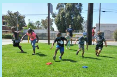
Outdoor Fun at Colorado Lagoon