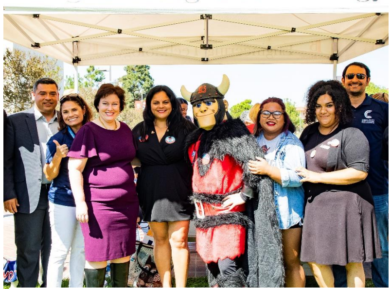
CITY CLERK STAFF AT LONG BEACH POLY FOR NATIONAL VOTER REGISTRATION DAY