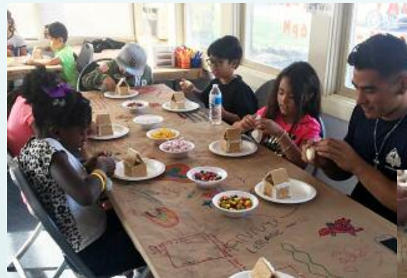
Making Gingerbread Houses

Parks, Recreation & Marine staff are proud to provide safe and enriching environments that foster growth and encourage fitness and positive engagement in the community.