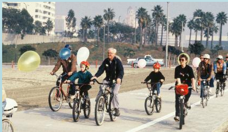
Opening Day on January 9, 1988

The Long Beach Shoreline Bicycle and Pedestrian Path activated an under-utilized beach and provided a safe, accessible recreational resource to further the City’s bike-ability and healthy lifestyle goals.