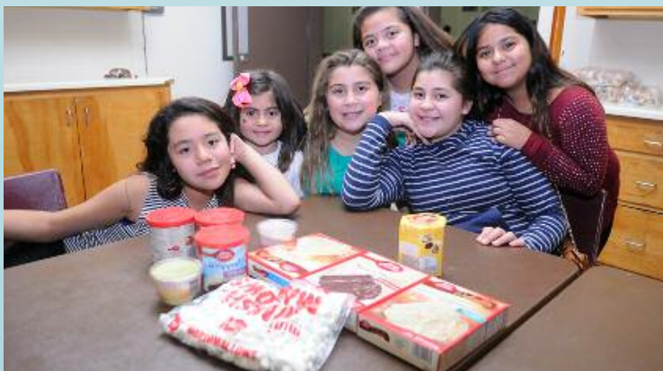
Getting Ready Bake