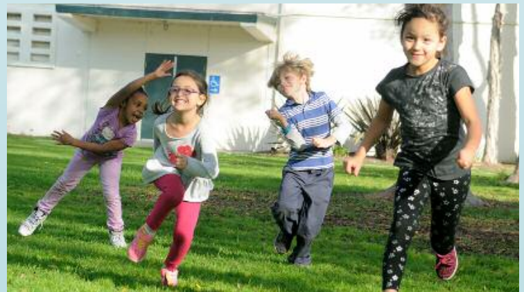
It's Great To Be Outside!