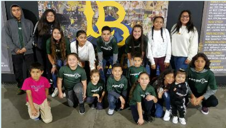
Field Trip to CSULB Men's Basketball Game