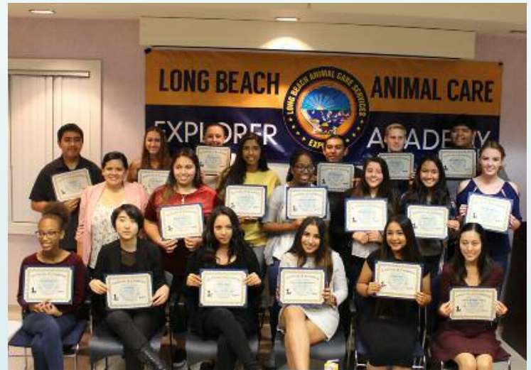
2018 ACS Explorer Program Graduates

The Explorer program prepares youth ages 15-19 to transition from school to work. The Explorer curriculum incorporates field trips and presentations by animal care experts to show how animals are cared for and managed, and special investigations teams who discuss how animal incidents are reported and managed. The Explorers are positively influenced by adult role models who demonstrate the importance of caring for animals and the impact of advocating for spay/neuter and adoption programs that contribute to Long Beach becoming the safest large City for people and animals.