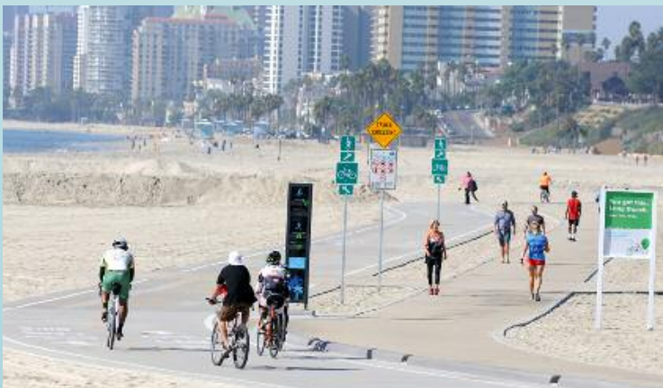
Residents now have separate paths to walk or ride along the beach.