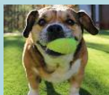
Animal Care Services