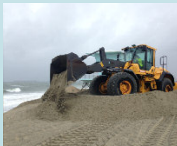
Beach Crews Fortify Sand Berms To Prevent Residential Flooding