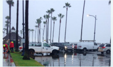
Flooding at Wardlow Park Community Center entrance and beach parking lot