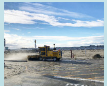
Crews Clear Sand from Beach Bike and Pedestrian Paths