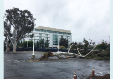
Fallen trees at Shoreline Aquatic Park and Catalina Landing