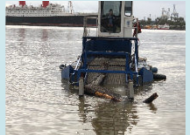
Debris Boom & Trash Skimmer Work To Minimize Debris Impacts