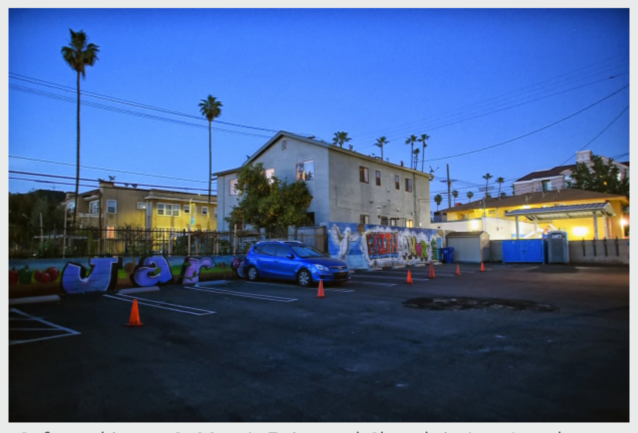
Safe parking at St Mary's Episcopal Church in Los Angeles.