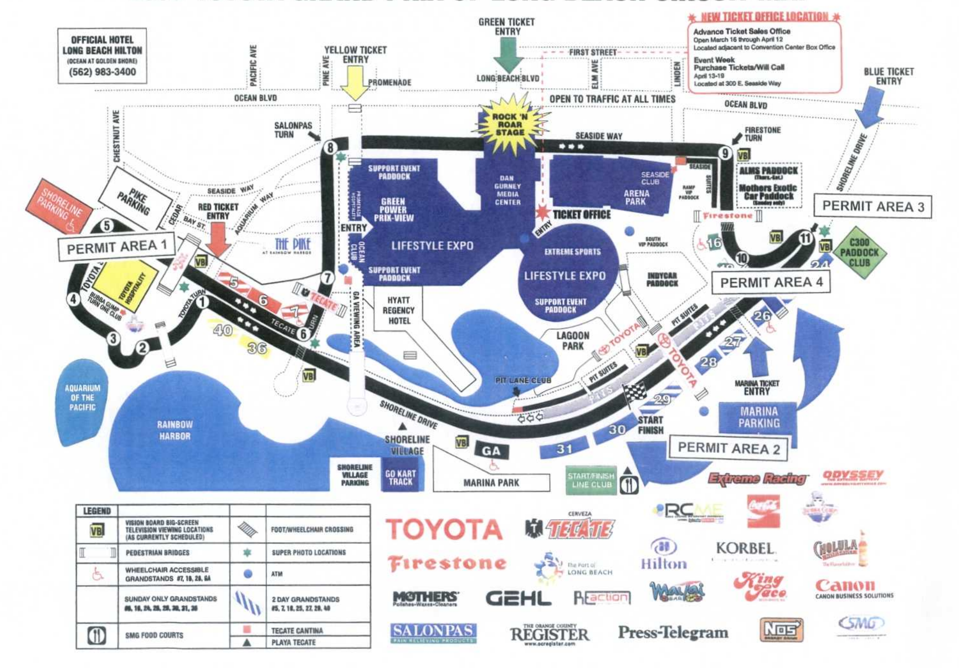
EXHIBIT A - PARKING PERMIT ACCCESS 2009 TOYOTA GRAND PRIX OF LONG BEACH CIRCUIT MAP