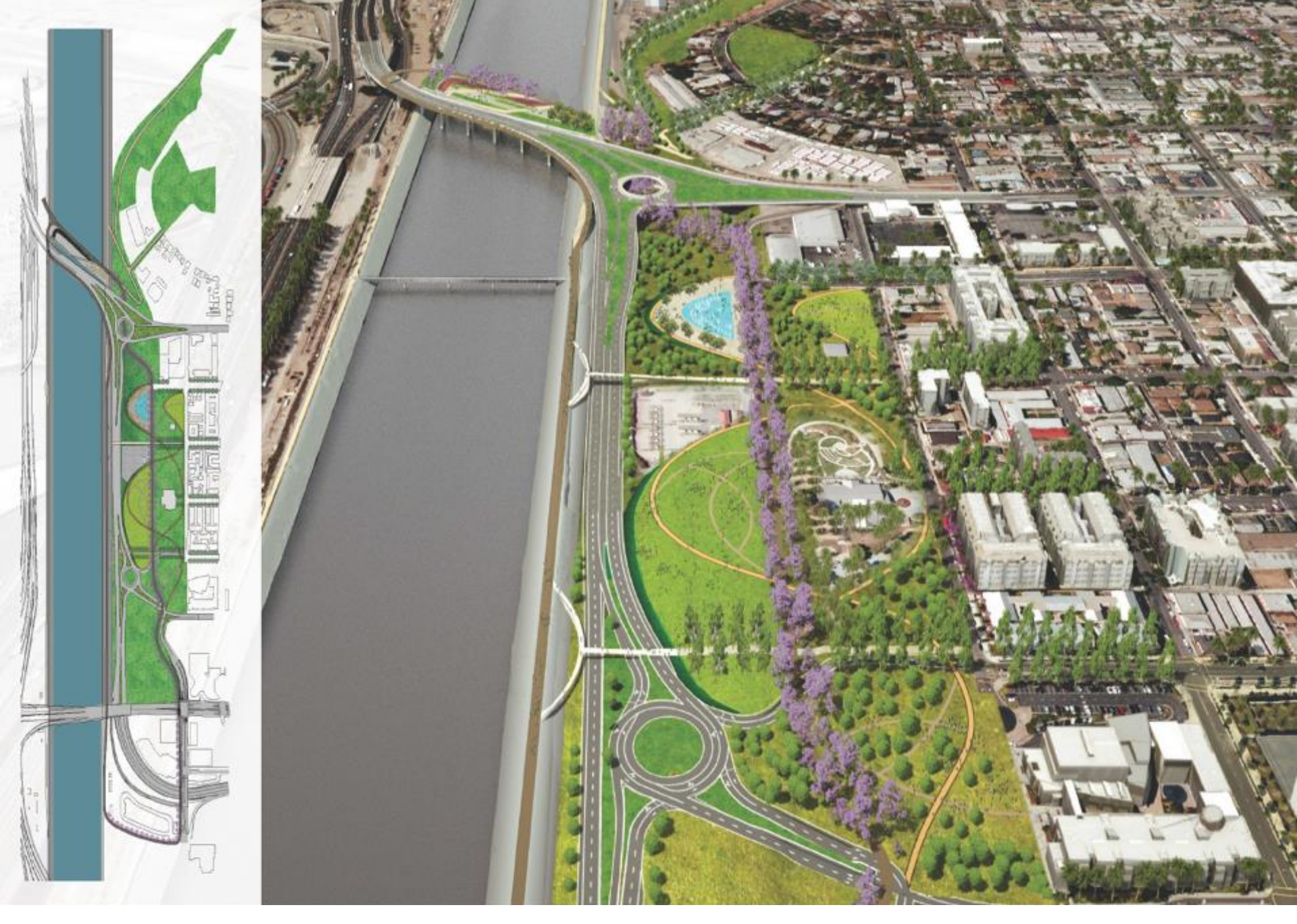
Building a Vision