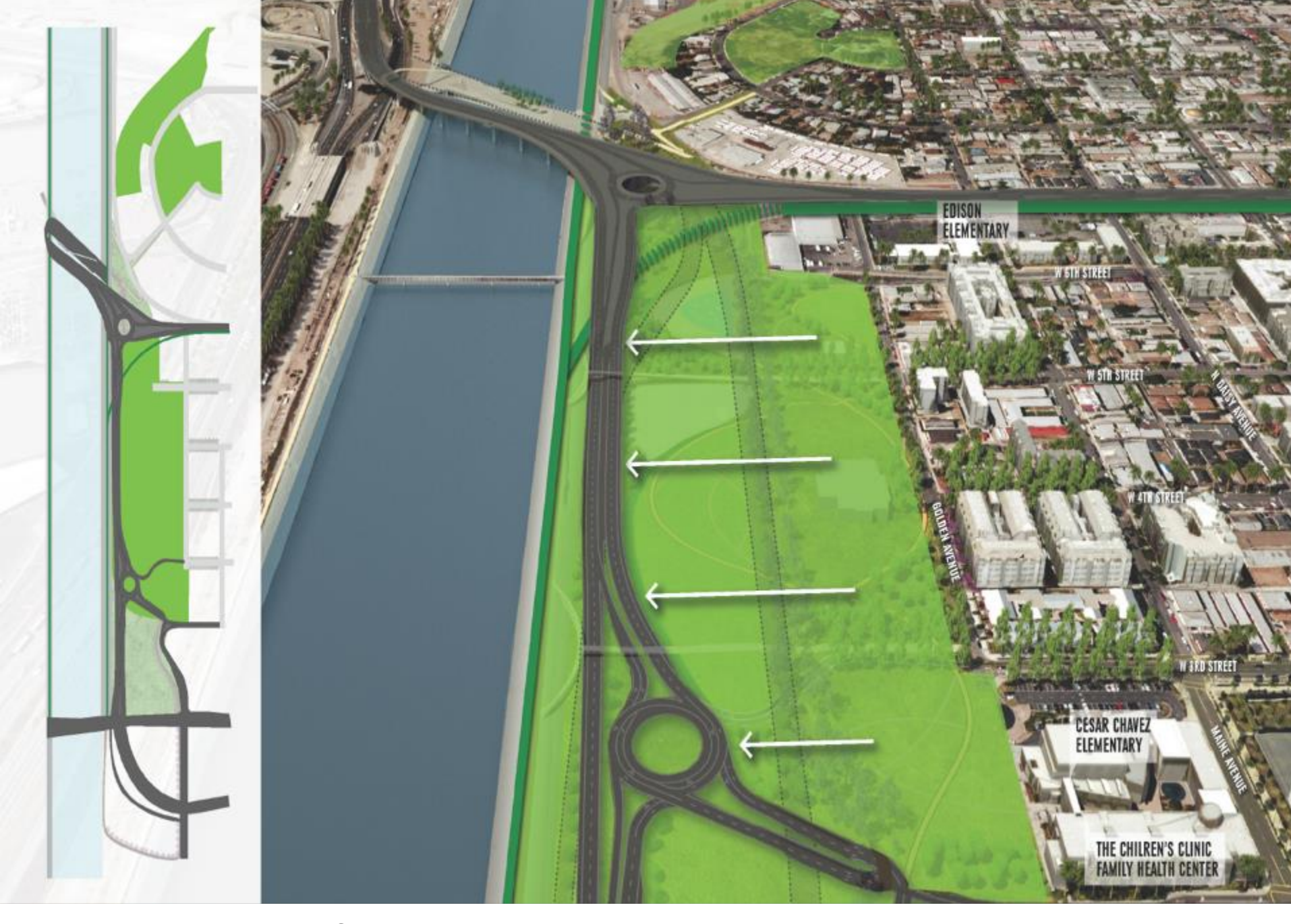
Making More Usable Space