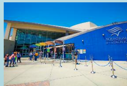
Aquarium of the Pacific