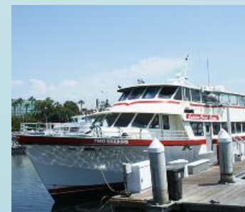
Catalina Classic Cruises