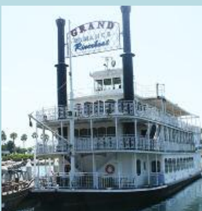
Grand Romance Charters