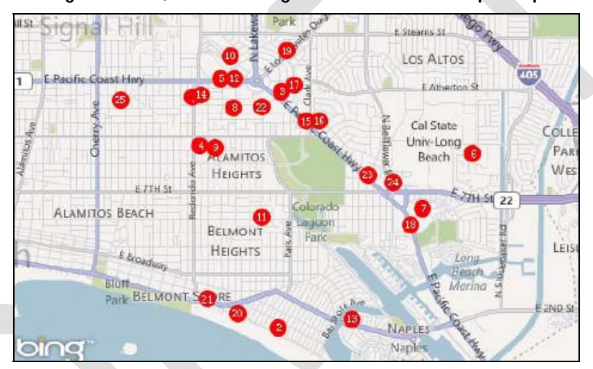
Figure 2. REIS, Inc., East Long Beach Submarket Comp Group