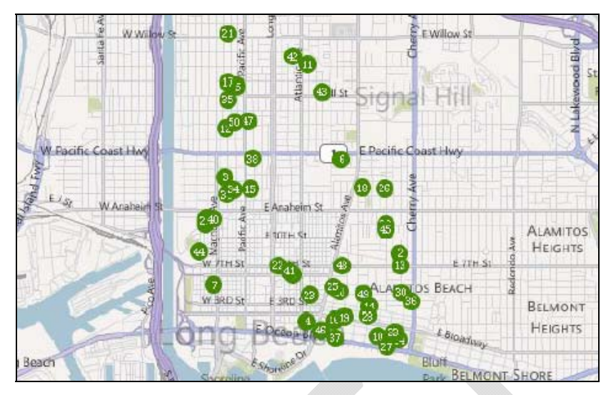
Figure 1. REIS, Inc. West Long Beach Submarket Comp Group