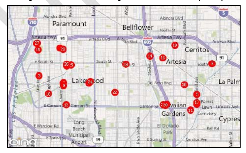
Figure 3. REIS, Inc., North Long Beach Submarket Comp Group