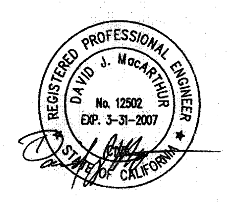
Exhibit A Page 1 of 2

DAVID J. MACARTHUR RCE 12502, EXP 3-31-07