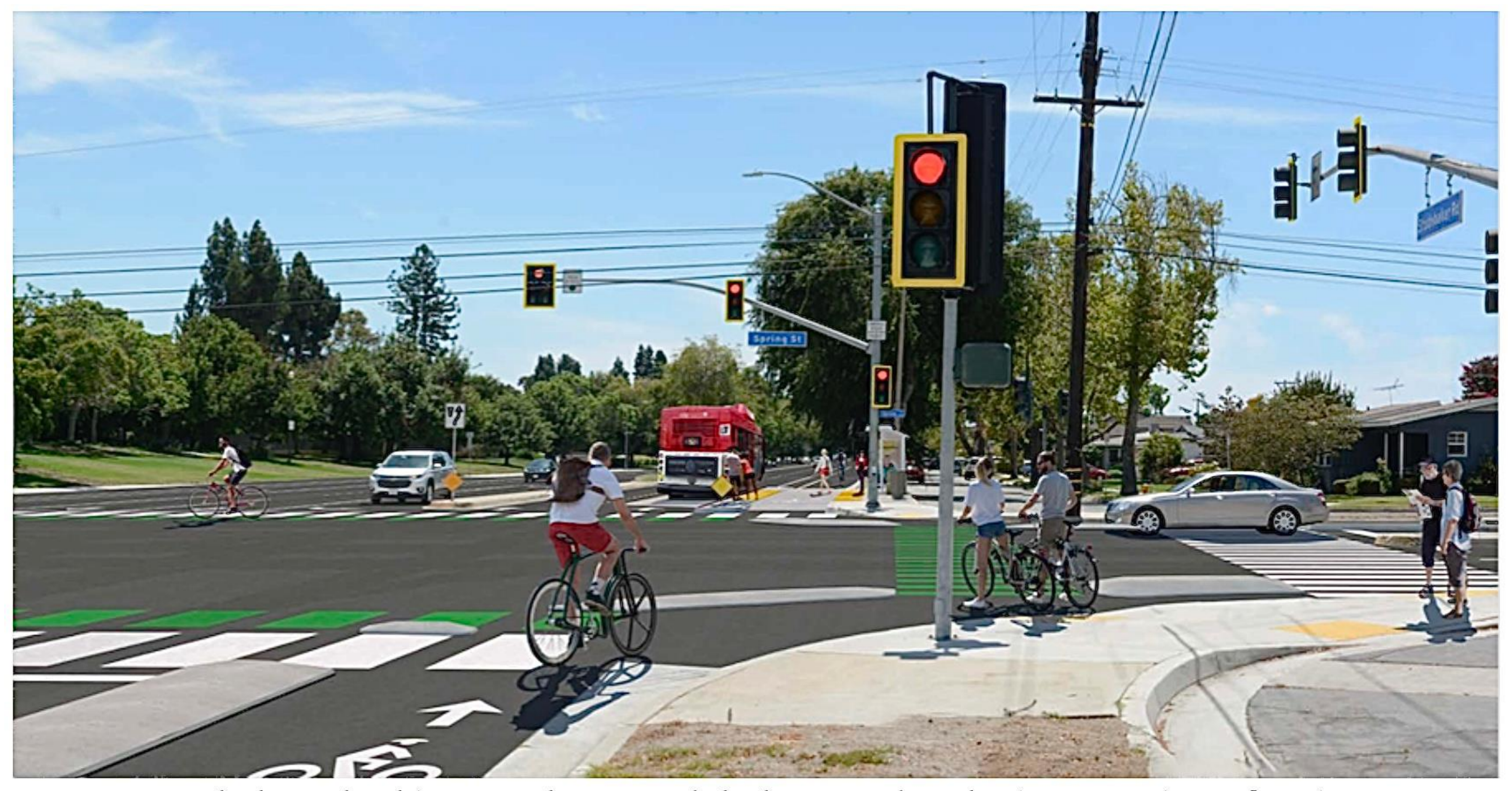
A conceptual photo looking south on Studebaker Road at the intersection of Spring Street.