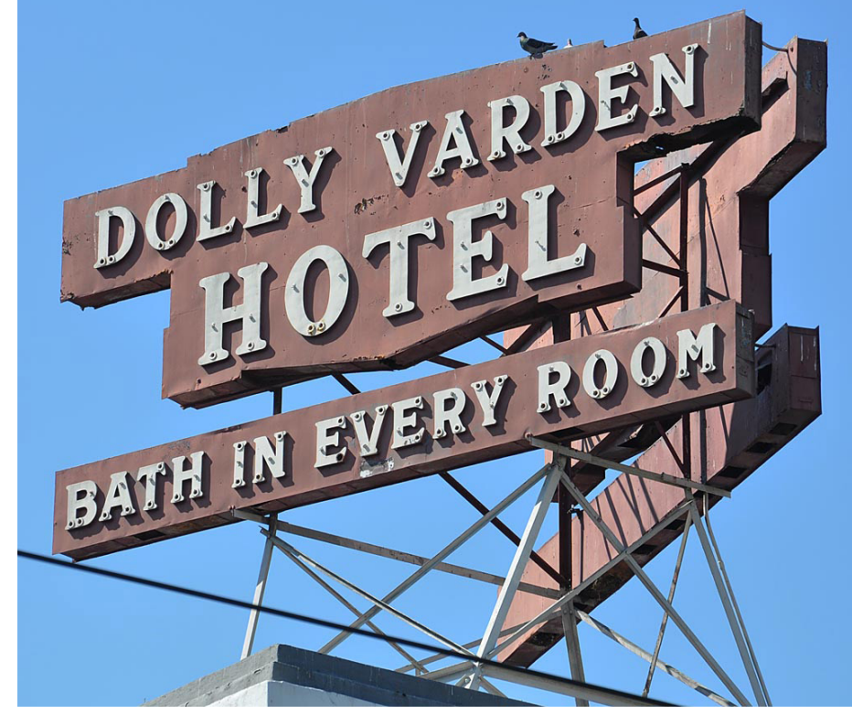
Historic Dolly Varden Rooftop Sign Enlarged Photographs