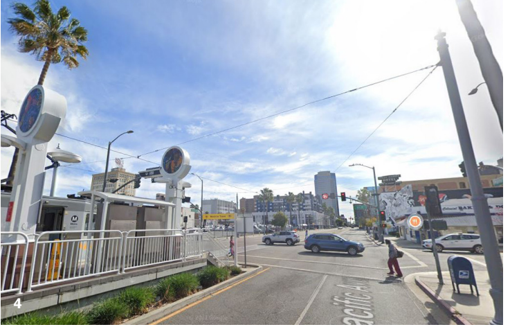
Context Vicinity Map + Street Views