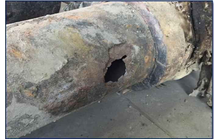
8-inch ductile iron pipe