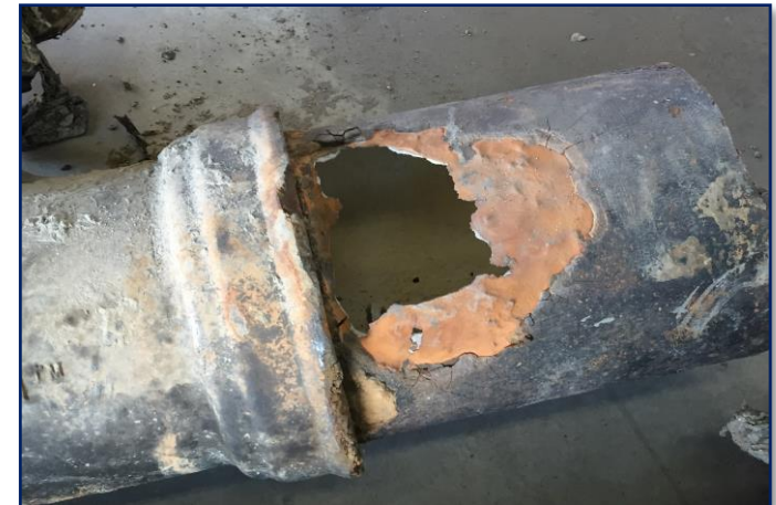
12-inch ductile iron pipe