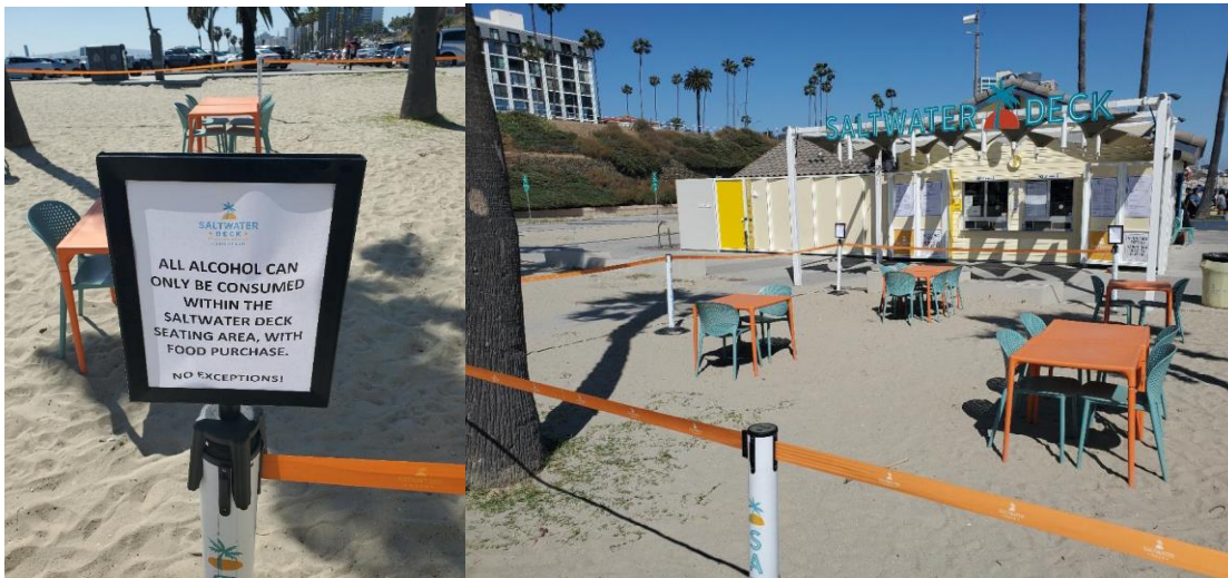
EXAMPLE OF SIGNAGE AND ROPE OFF FOR ALCOHOL CONSUMPTION AREA

SIGNAGE AND ROPE EXAMPLE SHOWN BELOW WILL BE USED TO DESIGNATE ALCOHOL CONSUMPTION AREAS.