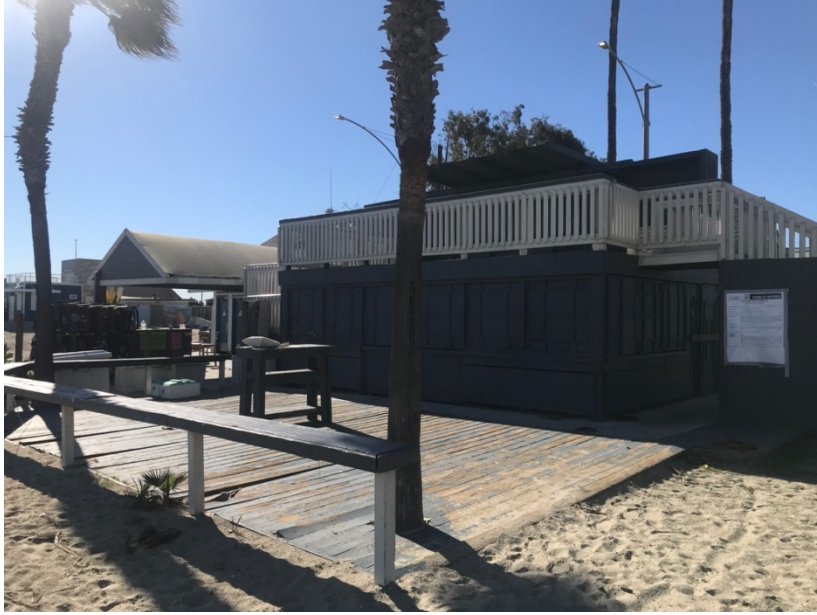
(OLD PHOTOS) GRILL EM ALL SITE – REMODELING IN PROCESS EXTERIOR SEATING AT PATIO AND ROOF TOP DECK.

SIGNAGE AND ROPE EXAMPLE SHOWN BELOW WILL BE USED TO DESIGNATE ALCOHOL CONSUMPTION AREAS.