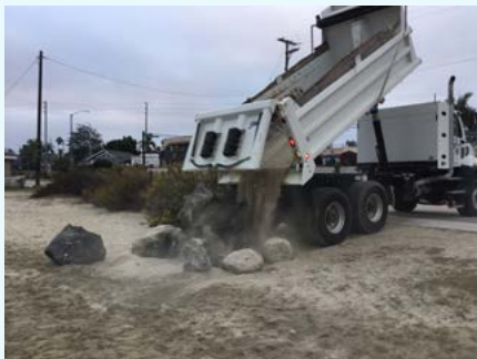
Beach Maintenance delivers three truckloads of sand for grading

Ben and his volunteers disposed of old fencing, and removed dead plants to make room for fill sand in the West arm bank. They replaced damaged fencing and graded 33 tons of sand, before working with the Friends of Colorado Lagoon to plan and plant new drought tolerant plants and boulders in front of the fencing for security. The Eagle Scout project at the Colorado Lagoon was a huge success and went off without a hitch.