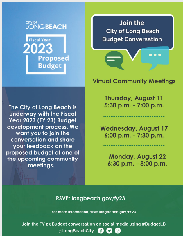
Community Budget Meetings Flyer