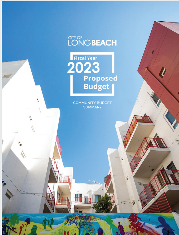
Community Budget Book

Translated versions available in Spanish, Khmer, and Tagalog