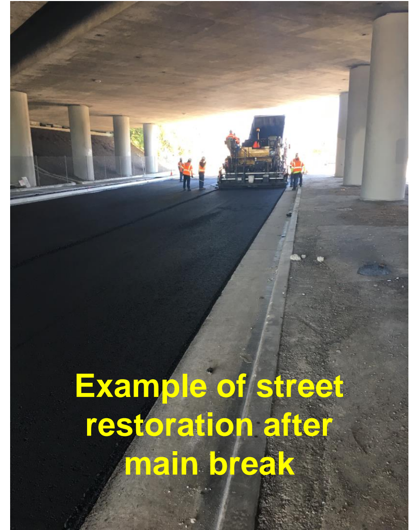
Example of street restoration after main break