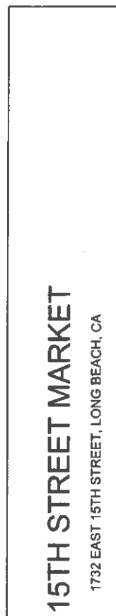
SCALE: 1/2" = 1'-0"