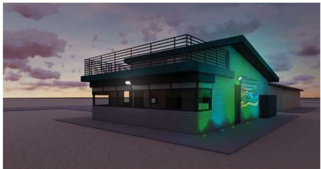
ATTACHMENT B: RENDERING OF NEW JR LIFEGUARD FACILITY