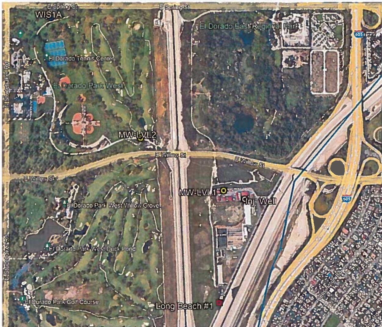
Figure 2: WRD Project Map showing El Dorado Regional Park West, El Dorado East Regional Park, WRD's Leo J. Vander Lans Advanced Water Treatment Facility (LVL), Los Angeles County Sanitation District - Long Beach Wastewater Reclamation Facility, proposed onsite Injection Well location (at LVL), proposed onsite Monitoring Well location (MW-LVL1), propose offsite Monitoring Well location (MW-LVL2), existing Long Beach Water Department Production Well Wise 1A (WIS1A), and existing WRD Regional Monitoring Well Long Beach #1.

MW-LVL2 is the subject of the recommended action.