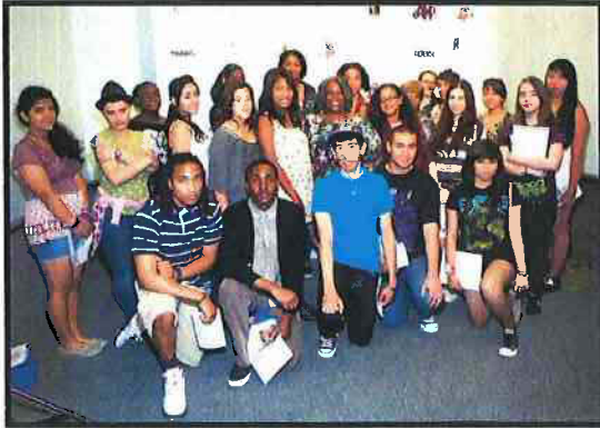
Students at Stop The Pain, Teen Summit . The PRC created this event to educate young adults about bullying and dating violence , and how to bring an end to them.

The Positive Results Corporation teaches leadership and character development skills in order to promote healthy, sustainable relationships, and prevent acts and exposure to violence and high risk behaviors.