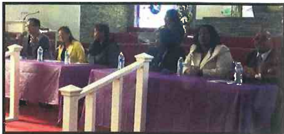
Pieces of Hope panelists. The PRC presented a "Real Talk" discussion on Teen Dating Violence, Healthy Relationships & Healing.

The PRC is an approved service provider for youth leadership in Los Angeles County. We are Certified Advocates in Domestic Violence, Sexual Assault & Gang Alternative Prevention.