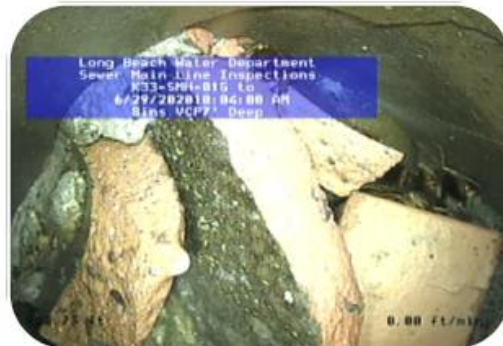
Tap Factory Defective @ 188.7'