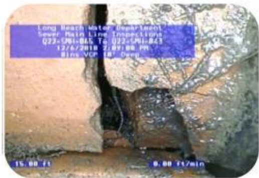
Broken @ 15.0'