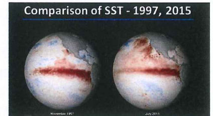
SST means Sea Surface Temperature