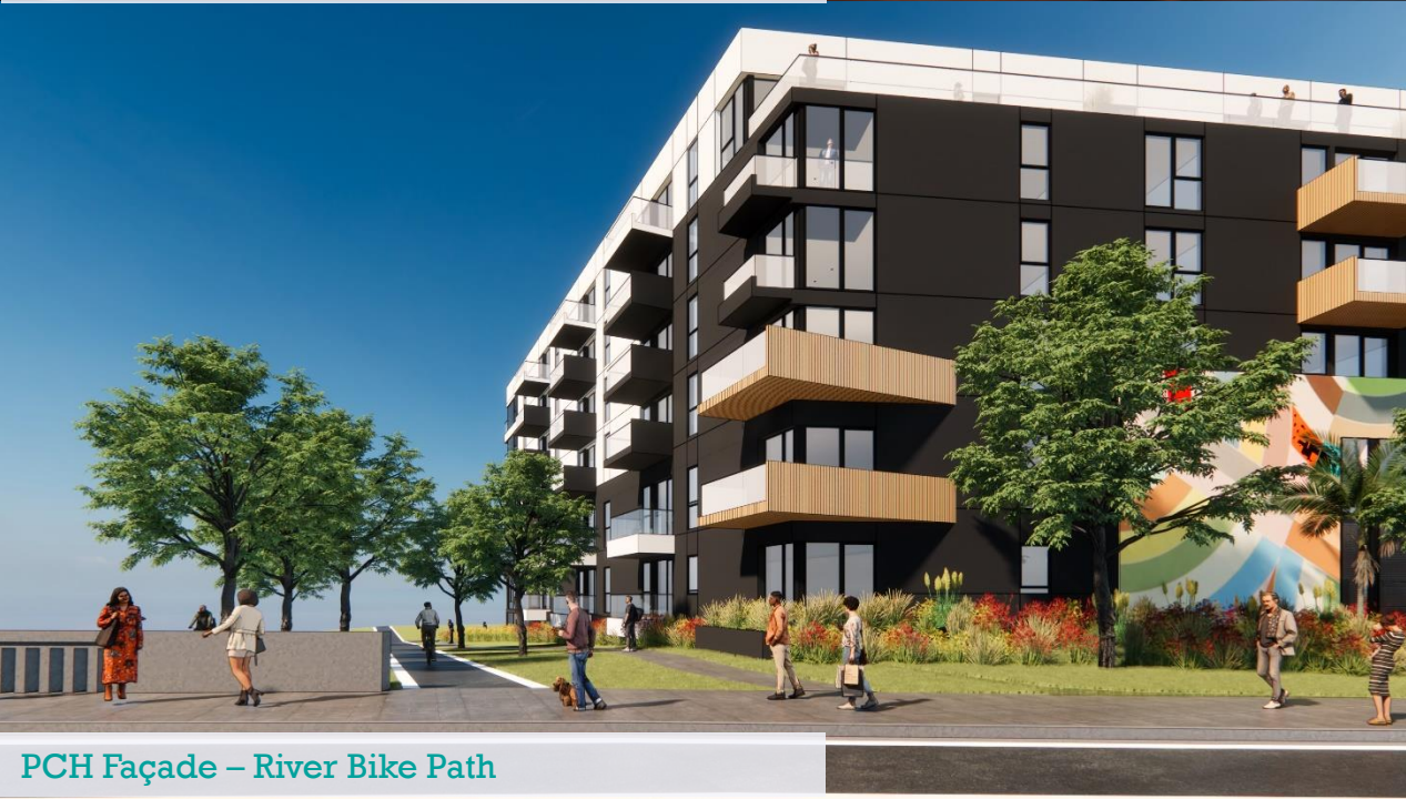
PCH Façade – River Bike Path