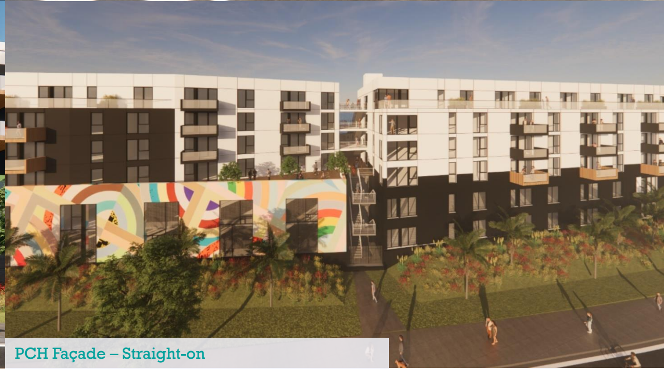
PCH Façade – Straight-on