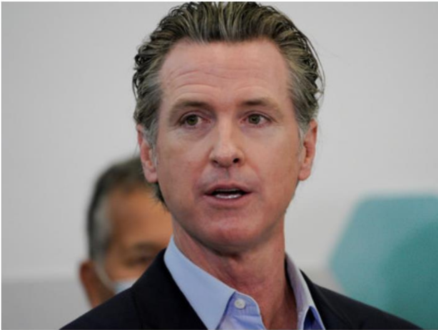
Governor Gavin Newsom speaks with reporters in San Diego