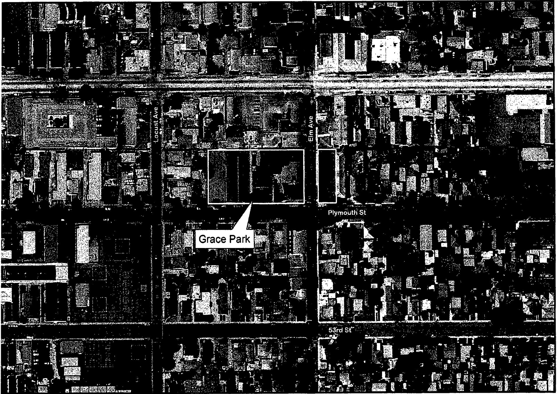
Grace Park Plymouth St. and Elm Ave.