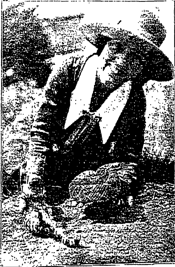
How would you like to hold a rattler in your hand, as this fellow is being held?