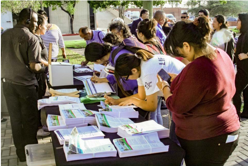
Over 280 people attended the Public Hearings

Results in an Estimated Total of 2,200 to 2,500 Individual Public Comments