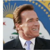
Gov. Arnold Schwarzenegger

Communities United Against Police Brutality (MN)