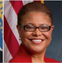
Rep. Karen Bass