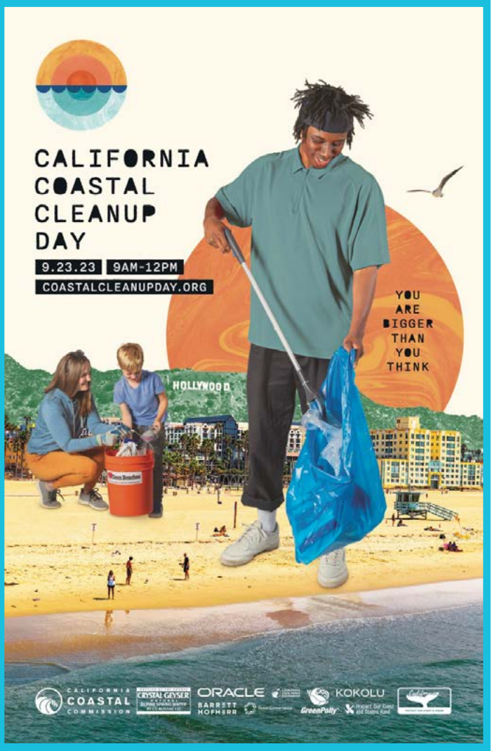
PARTICIPATE IN COASTAL CLEANUP DAY ON SEPT. 23 FROM 9 A.M.-NOON AT VETERANS PIER

Residents can browse the new and existing fall classes in the latest issue of Recreation Connection, PRM's programs catalog, at LBParks.org or pick up a copy at Long Beach park community centers and Long Beach Public Library branches.