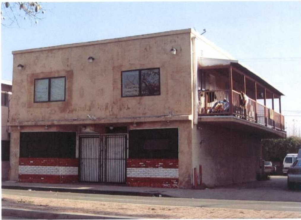
Exhibit B Site Photograph