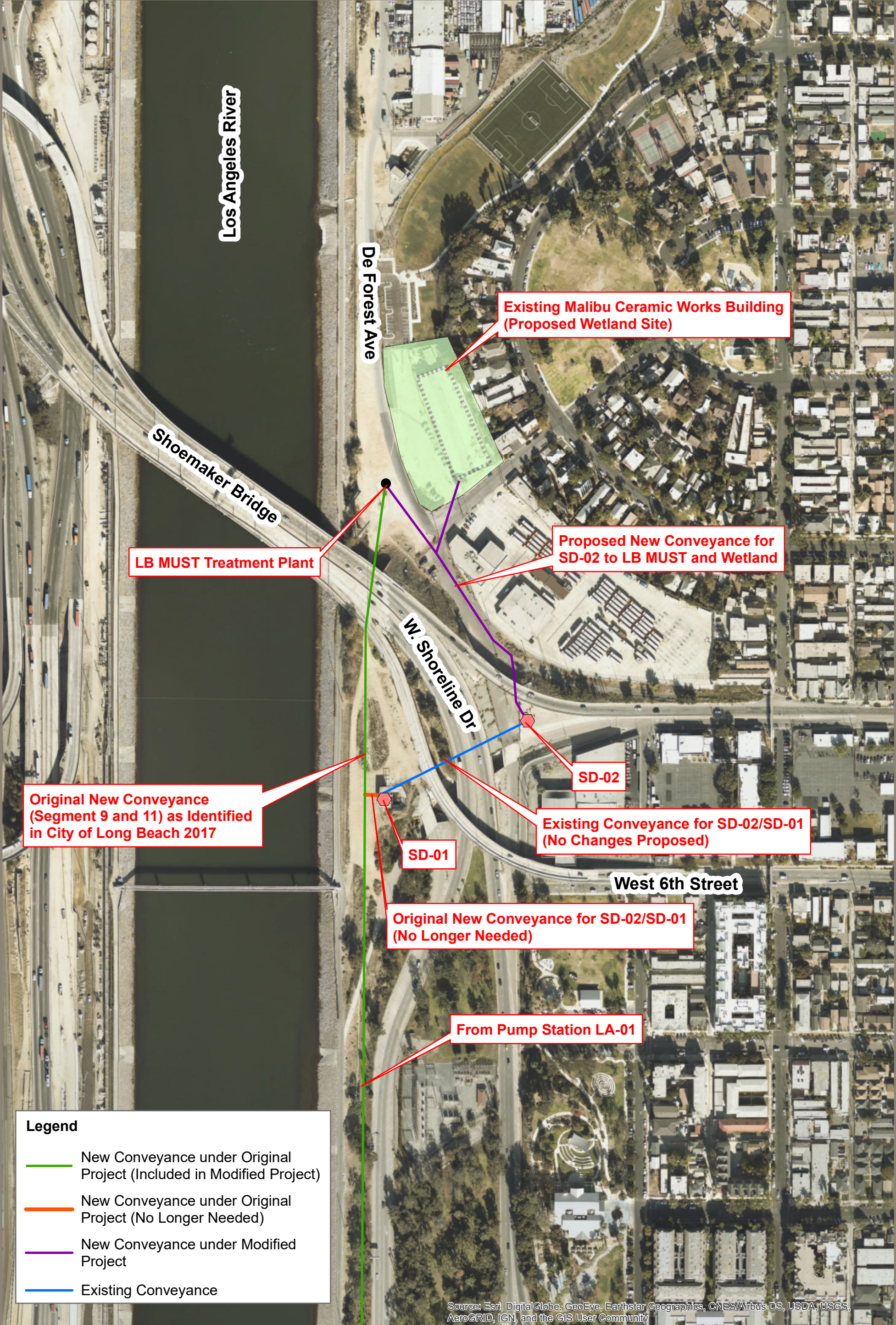
FIGURE 6 LONG BEACH MUST PROJECT MODIFIED PROJECT - PROPOSED FORCEMAIN ALIGNMENT

This map is not intended to replace a survey by a Lic. California Surveyor. Stantec does not certify the accuracy of the data. This map is for reference only and should not be used for construction.