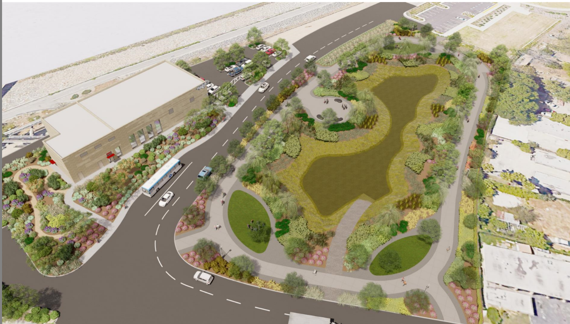
FIGURE 7 LONG BEACH MUST PROJECT WETLAND CONCEPTUAL PLAN