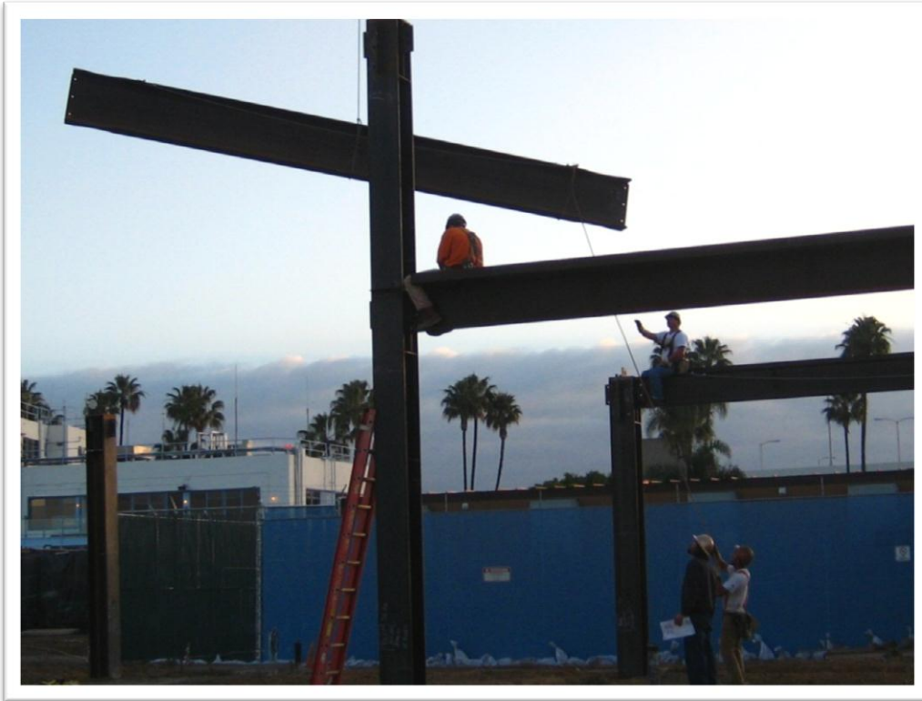
Start of Steel Erection South Holdroom