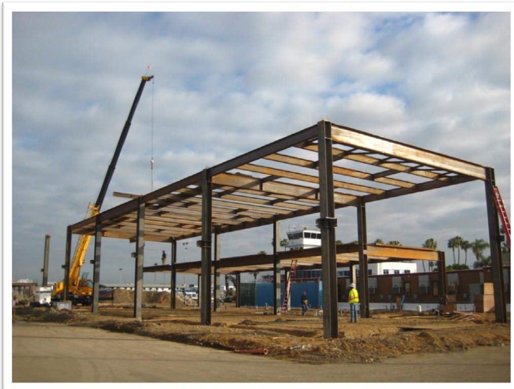
South Holdroom Steel Erection