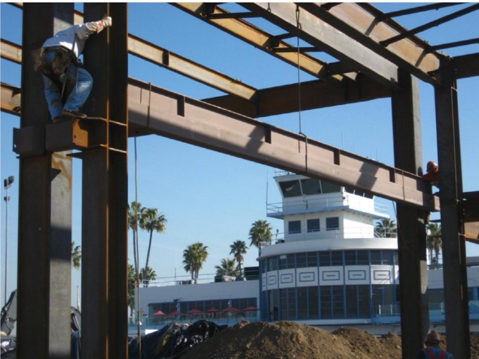
Garden Area and South Holdroom Steel