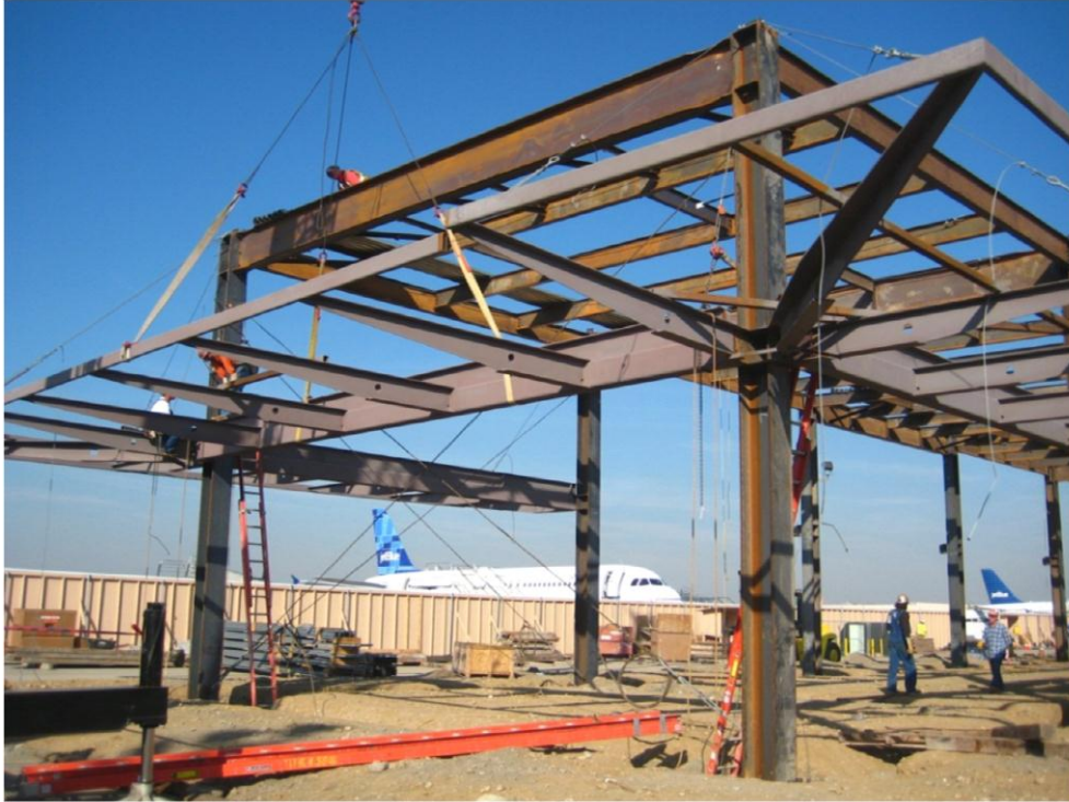
South Holdroom Steel Canopy Erection