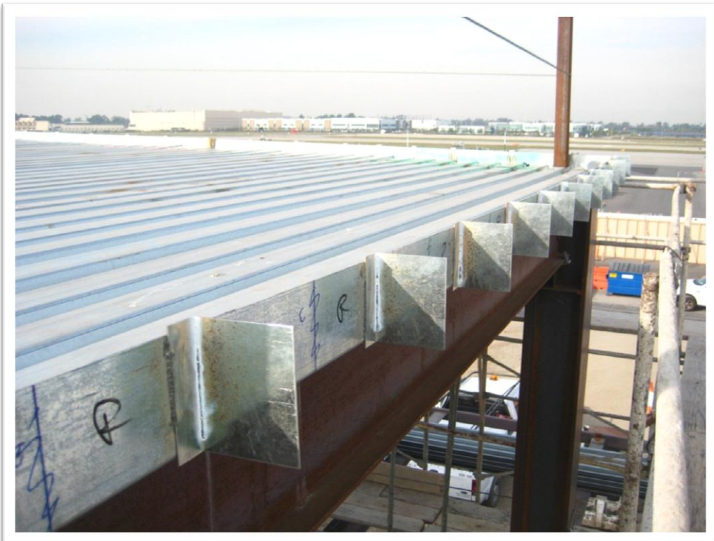
Welded Clips at North Holdroom East Wall