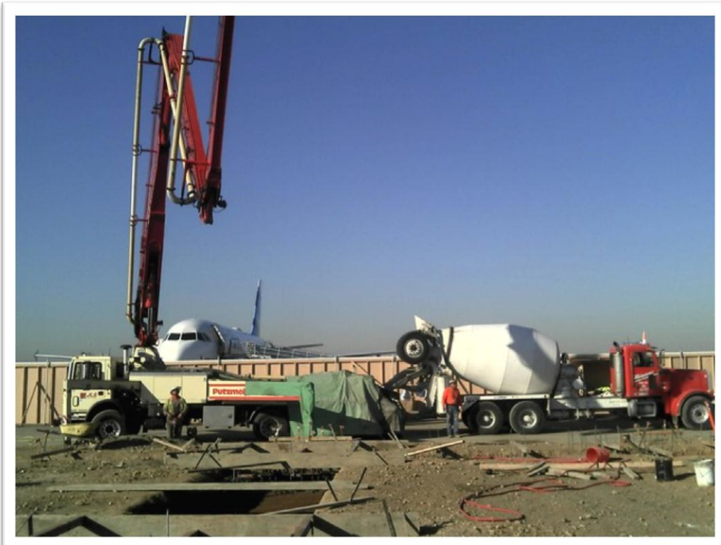
Concrete Footing Pour at South Holdroom