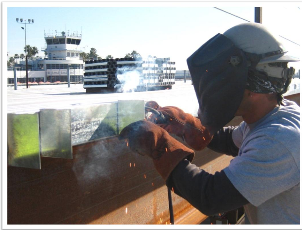
Welding of Framing clips at North Holdroom