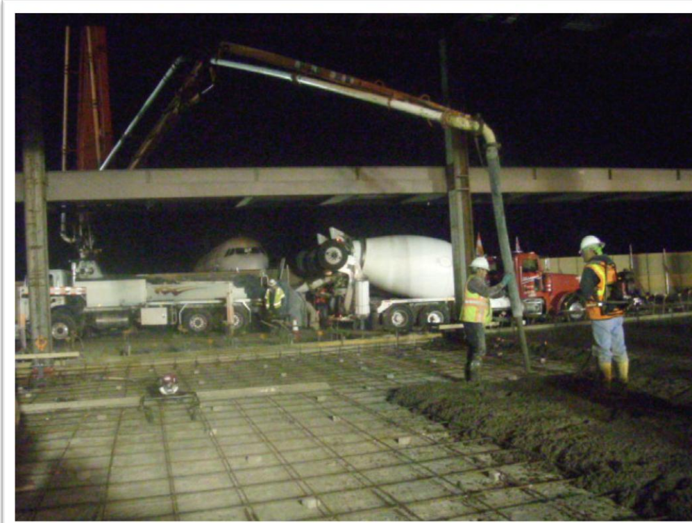
Concrete Slab on Grade Pour #2 at North Holdroom