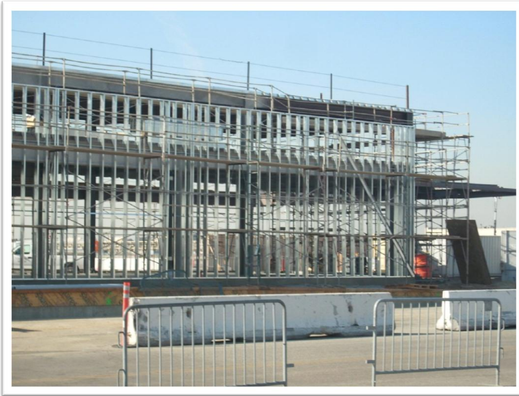
Framed Exterior Wall East side North Holdroom