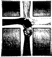
Covenant Presbyterian Church