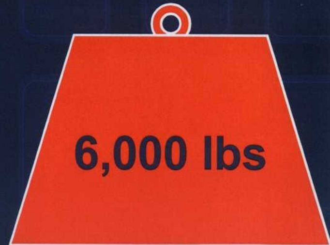
Gross Vehicle Weight (Empty)