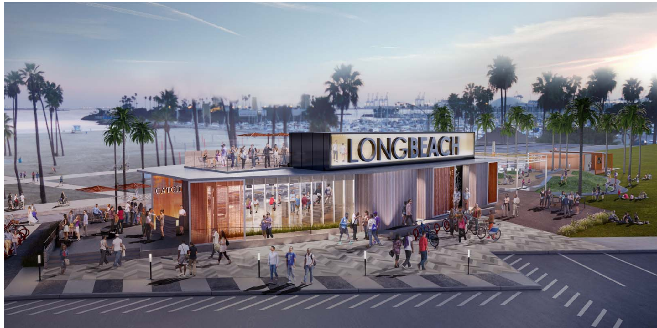
ATTACHMENT B CONCEPTUAL RENDERING