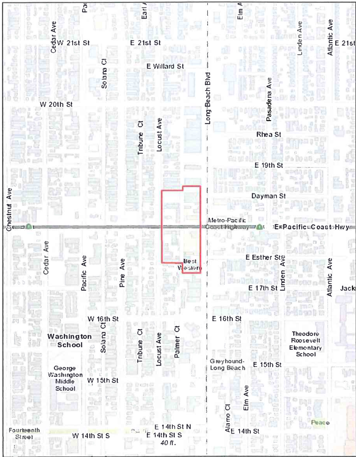
Figure 1- Vicinity Map