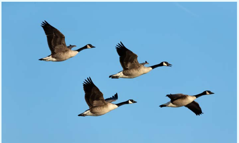
Catch a glimpse of the Canadian Goose migration at the El Dorado Nature Center. Nature trails are open Tuesday-Sunday 8 a.m.-5 p.m.

A great example of a migratory bird is the Canada Goose. Although we have plenty that have decided to permanently reside in our parks, you might see a few flying up above in a V formation as they make their way down south. During your next visit, keep an eye out to see if you can spot a bird who might be making a pit stop!