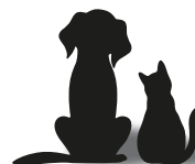
2020 Long Beach Animal Care Services Save Rates vs. National Average