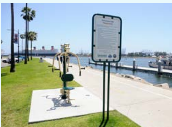
After months of COVID-19 closures, outdoor fitness areas and playgrounds are allowed to reopen for outdoor activities with new protocols and safety measures in place.