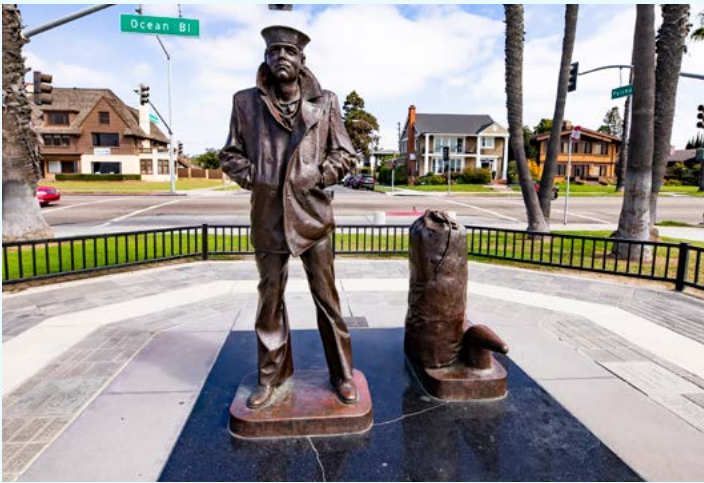
The Lone Sailor Memorial overlooking the Pacific Ocean stands in memory of those who have served our nation in a naval capacity.

As a former Navy town that once was home to the Long Beach Navy Base, it is fitting that Long Beach is the site of the Lone Sailor Memorial at Ocean Blvd. and Paloma Ave. The statue commemorates the past and present service of all men and women who have served and continue to serve our nation on the seas.