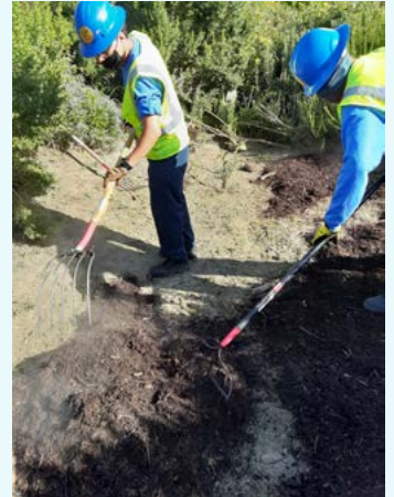
The Conservation Corp of Long Beach partners with PRM to maintain 15 acres of Willow Springs Park and provide job training to at-risk youth.