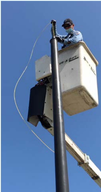
Left: team installs wiring for new L.E.D. tennis court lights. Center: Old 1930's festoon type lighting. Right: six new LED poles and fixtures light up the courts at Silverado Park.