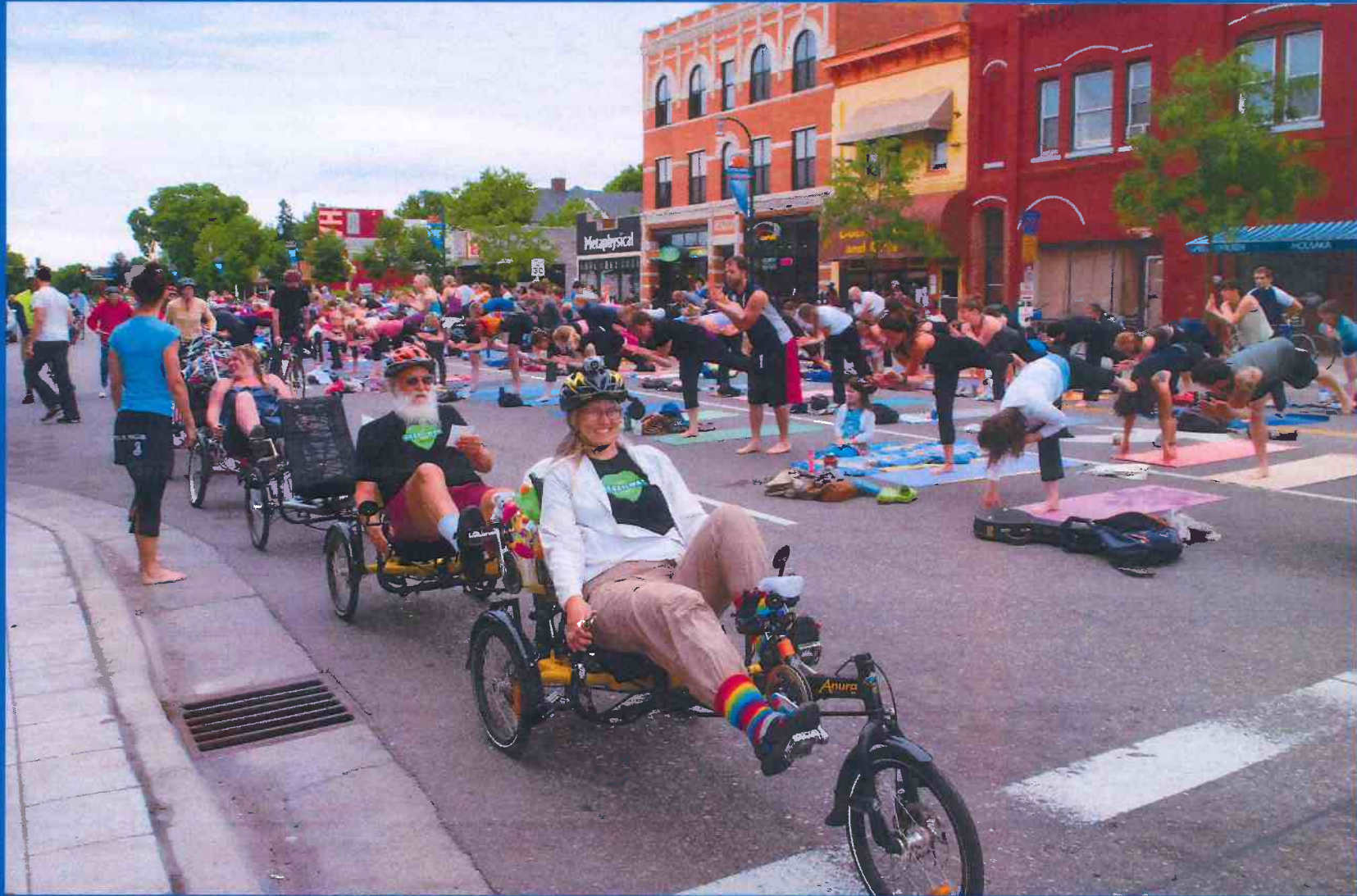
An open streets initiative in Minneapolis.