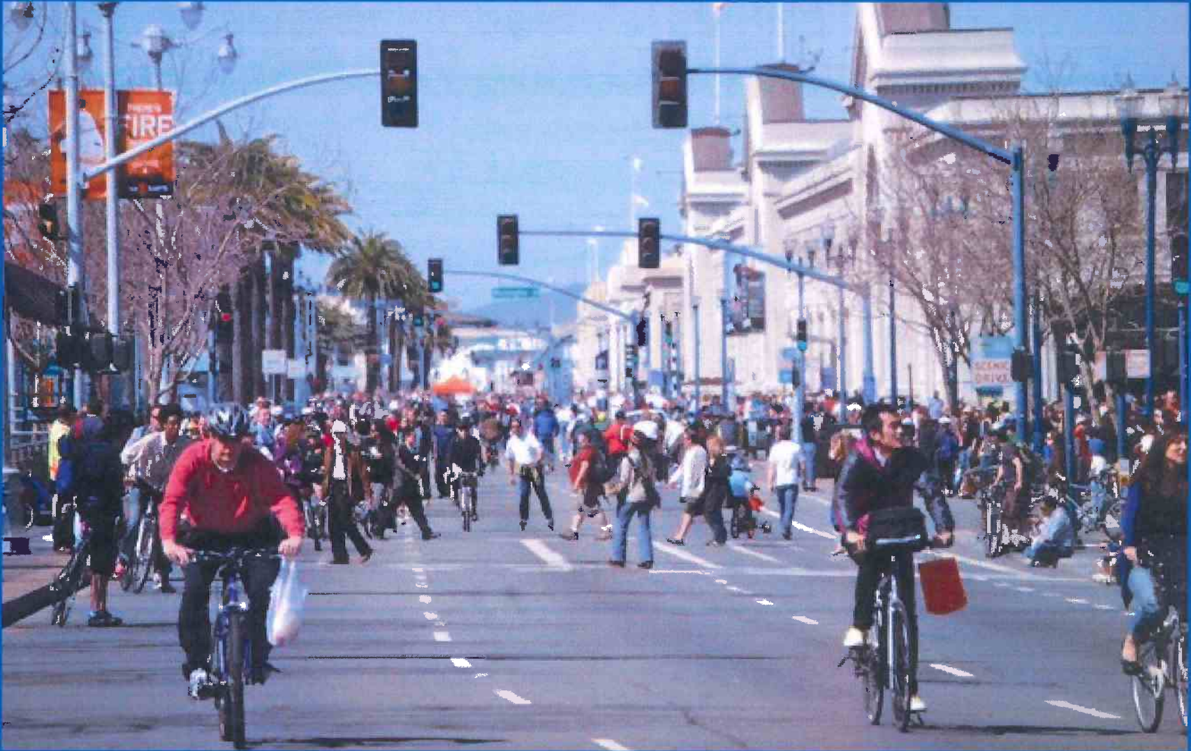
San Francisco Sunday Streets.