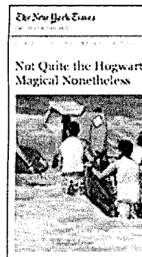
KPCC: LA Surf Bus, a Wave