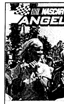
From the OC Register: All Aboard The Surf Bus