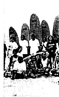
Watch the video