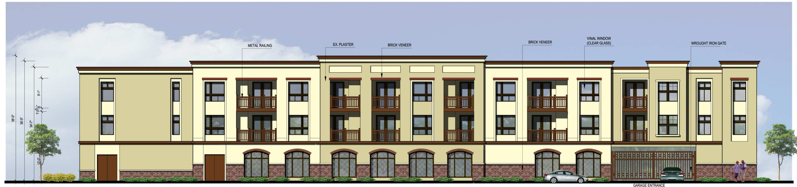
WEST ELEVATION SCALE: 1/8" = 1'-0"