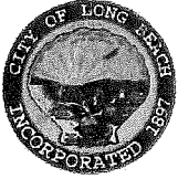
EXHIBIT "B" PLEASE GIVE A COPY OF THIS TO YOUR INSURANCE BROKER OR AGENT