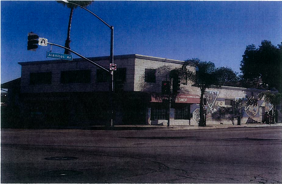
View looking southeasterly at the subject property from the intersection of Alamos Avenue and 7 th Street. See additional photographs in the Addenda Section.