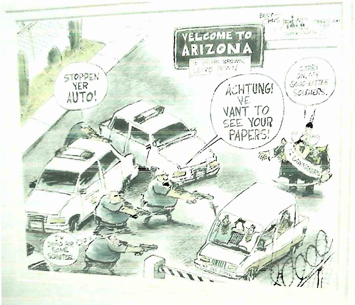
Wall hanging- Senator Ricardo Lara's Long Beach office