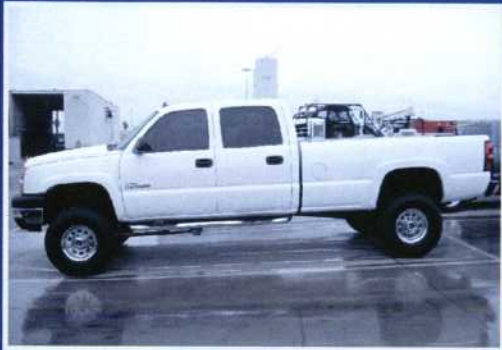
Heavy Duty Pickups