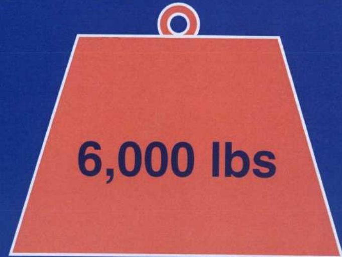
Gross Vehicle Weight (Empty)