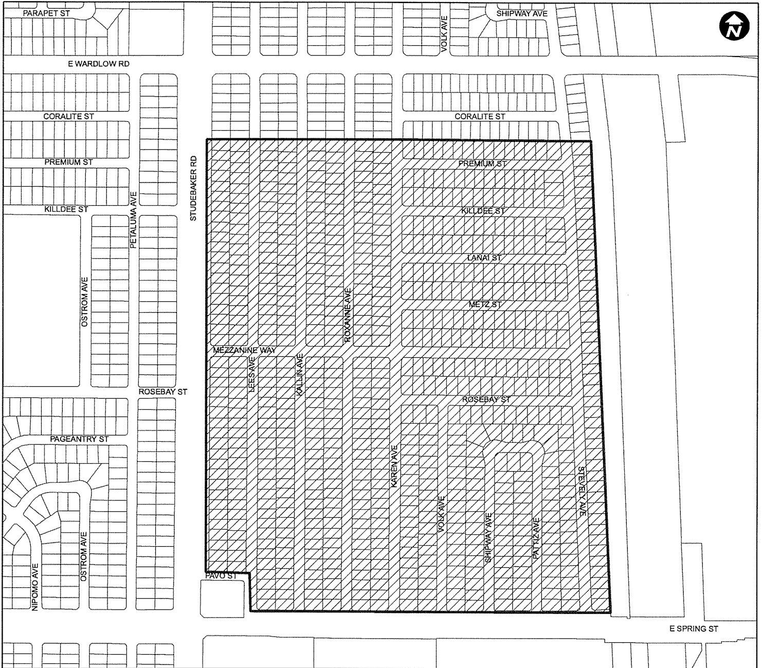
Rancho Estates Neighborhood