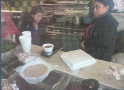
Menu Nutritional Analysis