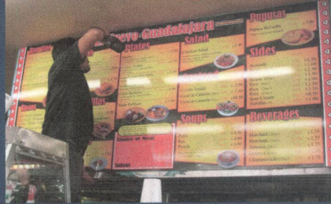
New Menu Board with Calories Posted