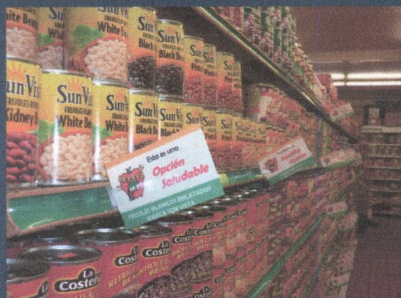
Healthier Options Labels