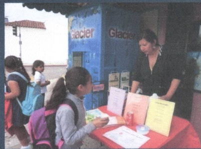
Nutrition Education and Outreach